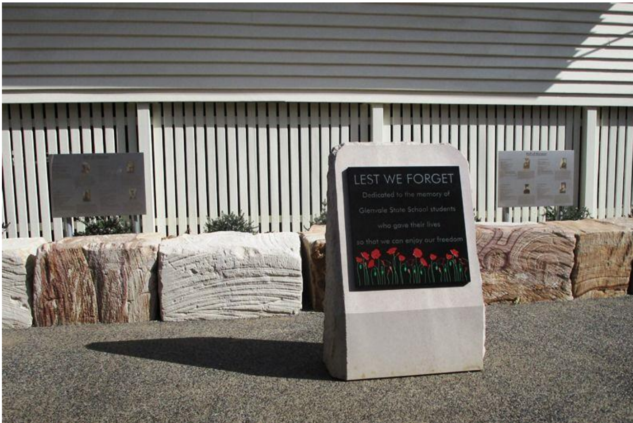
Glenvale State School War Memorial