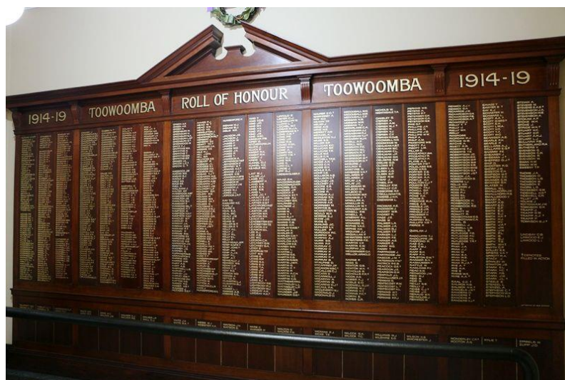
Toowoomba Roll of Honour