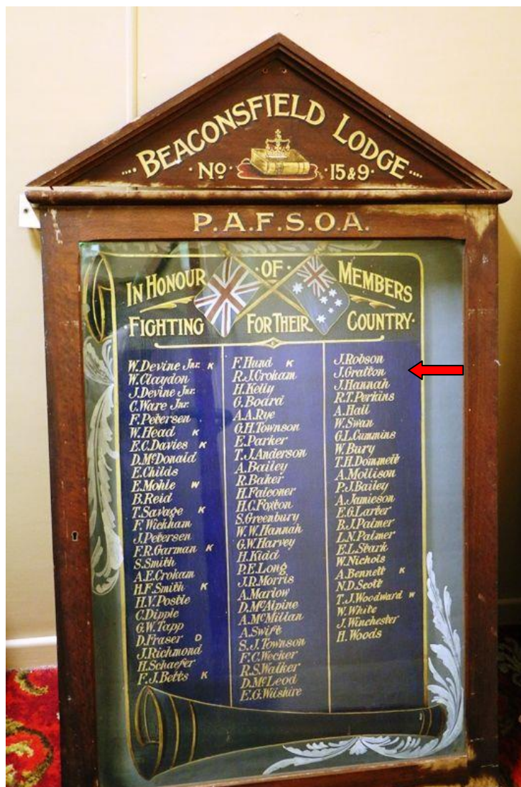
Beaconsfield Lodge No. 15 & 9 Honour Roll